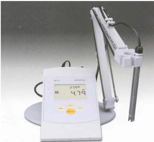
Photo: Housing design of PB-10